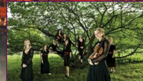
Angèle Dubeau & La Pietà - July 12