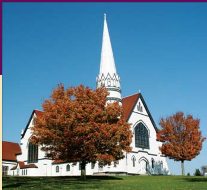
St. Mary's Church, Indian River Festival